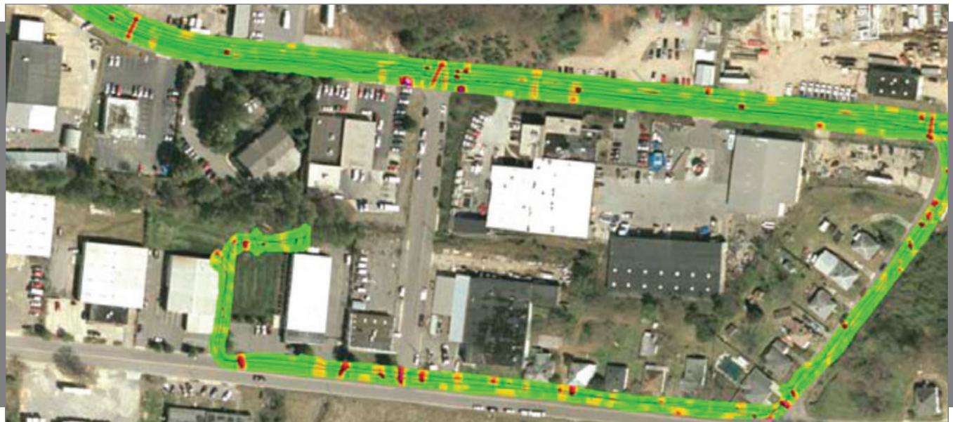
Example data obtained along streets in Raleigh, NC, superimposed upon an aerial photograph of the area. The survey was undertaken to detect all utility lines (water, sewer, powerline, telephone and fiber optic cables) buried under the road. Faint black lines indicate the ground track of the array.